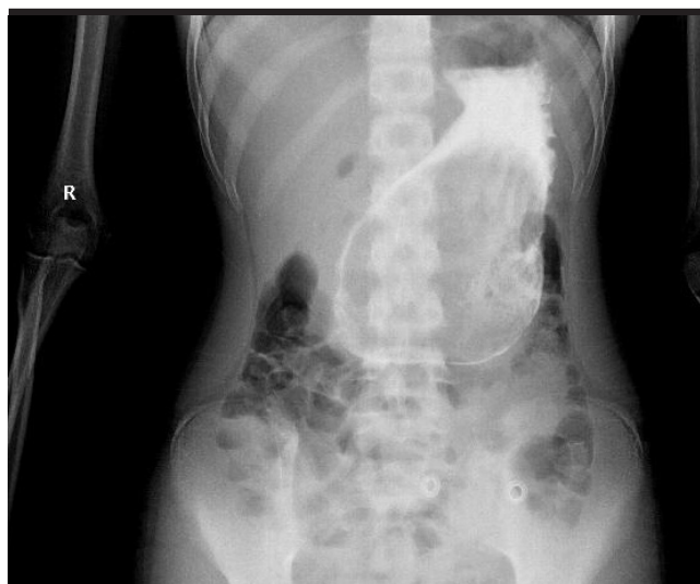
Figure 1. On barium abdominal X-ray and computed tomography, the stomach was found to be distended and filled with a large solid mass

In 2013, Ladas et al. (3) published a review of adult cases with Coca-Cola administration and reported complete phytobezoar dissolution in 50% of cases and partial dissolution and concomitant endoscopic removal in additional 41.3% cases. Lee et al. (4) reported that complete dissolution of bezoars was observed in 23.5% of cases, whereas partial dissolution was observed in 76.5% cases treated with Coca-Cola administration. It is interesting to note that Coca-Cola is completely ineffective for persim-