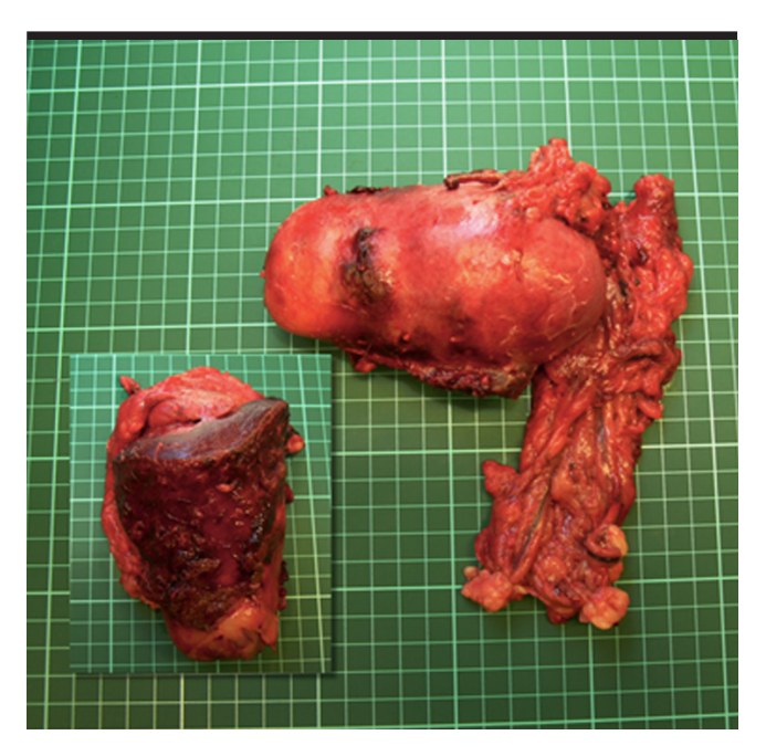
Figure 2. The resected gallbladder and liver after open cholecystectomy, in combination with en bloc wedge-liver resection. There was extensive mural thickening of gallbladder with adhesions involving the transverse mesocolon, omentum, and duodenum