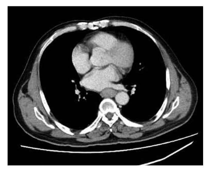
Figure 3. A CE-CT scan demonstrating an eccentric thickening in the lower third of the esophagus wall, with a moderate enhancement

mary malignant tumors of the esophagus. It most often occurs in men, and most patients are in their sixth and seventh decades (1). Dysphagia and epigastralgia are the chief complaints of patients with PMME (2). Nonspecific clinical symptoms are easily ignored, which delays the diagnosis. In approximately 90% of the PMME cases, the most frequent location is in the middle or the distal third of the esophagus probably because of a greater concentration of melanocytes in these regions (1,3).