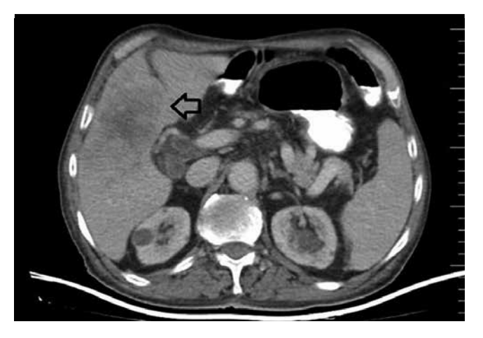
Figure 1. An abdominal computed tomography showed multiple metastatic nodular lesions, the largest of which was 6 cm in size (arrow)

In this article, we first emphasize that the physical examination was the essential key of medicine in the past; however, now, with the growing reliance on advanced technology, complicated and expensive methods such as PET and MRI are more frequently used (1). Actually, when looking for a metastatic location, the genitourinary system examination should be particularly performed before further investigation. In this case, a complete physical examination was not conducted by the primary physician. Second, the anal melanoma is not only an exceptionally rare neoplasm but also particularly an aggressive disease