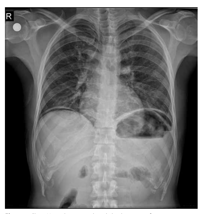
Figure 1. Chest X-ray showing right subdiaphragmatic free air

Informed Consent: Written informed consent was obtained from the patient who participated in this study.