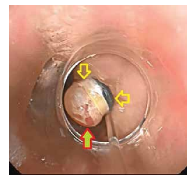
Figure 2. The use of the "double band" technique for the bleeding site of the fibrotic varix (two same color arrows shows two bands at the baseline of the varix, and another arrow shows the bleeding site)