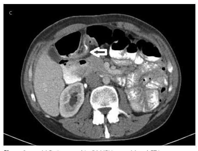
\textbf{Figure 2. a-c.} \ \textbf{(a)} \ \textbf{Barium graphic, (b)} \ \textbf{MRI image, (c)} \ \textbf{and CT image}