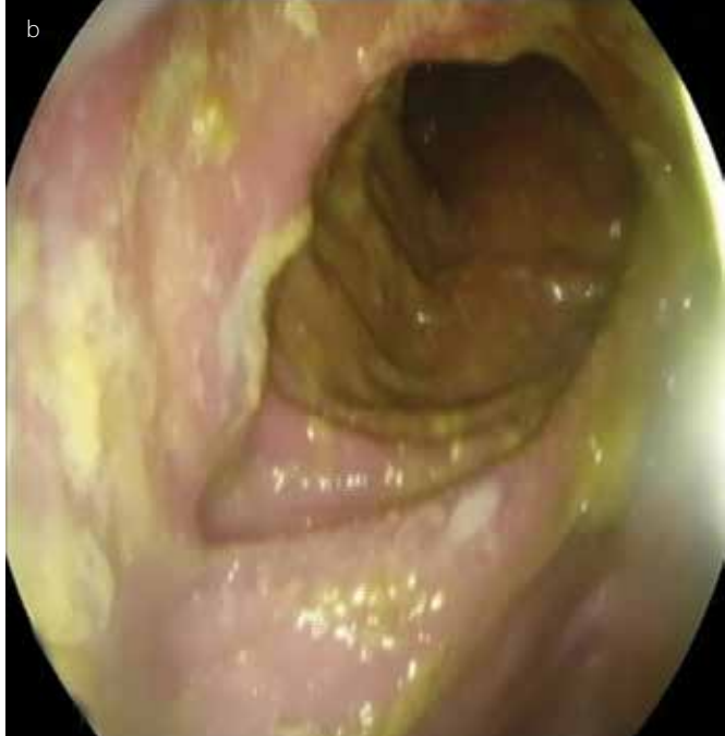
Figure 1. a,b. Endoscopic appearance of fistula orifice and duodenum, (b) and transition from fistula orifice to transverse colon

study to confirm the localization of the fistula, which only aided about the existence of fistula; the radiopaque passed quickly to the distal ileum segment. In order to confirm the existence of any other complications, radiological scanning (CT and MRI) was performed. The scanning only demonstrated a dilated small intestine and transverse colon (Figure 2). In October 2016, after obtaining the prior written informative consent, the patient was operated. A fistula between the third portion of duodenum and ileotransverse anastomosis and a stricture on terminal ileum 30 cm before anastomosis was observed. Strictured ileal segment