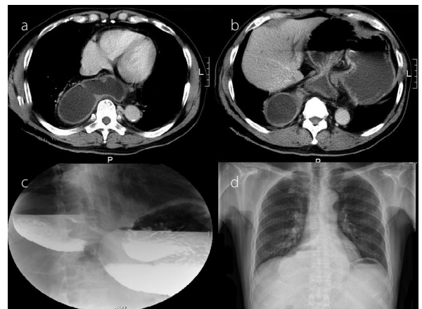
Figure 1. a-d. (a, b) A CT scan showing that the distal stomach and proximal duodenum herniated through the hiatus and well into the left chest and that the gastroesophageal junction (GEJ) and fundus remained in the abdomen. (c) An upper GI study showing the distal stomach and proximal duodenum with an air-fluid level located in the chest, and the GEJ and fundus with another air-fluid level remained in the abdomen. (d) A chest X-ray image showing a soft tissue opacity with an air-fluid level located in the right chest, and the fundus with another air-fluid level remained in the abdomen

Hiatal hernia is characterized by the protrusion of an abdominal structure other than the esophagus into the thoracic cavity through the widening of the hiatus of the diaphragm.(1) More than 95% of hiatal hernias are type I (small sliding hernias), where the GEJ migrates above the diaphragm(1). Paraesophageal hernias represent a subtype (types II to IV) of this disease and account for 5% of all hiatal hernias (1,2). In type II hernias,