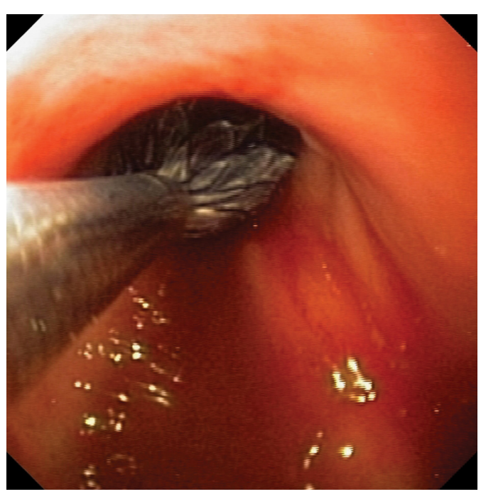
Figure 1. A colonic stent at the moment of release