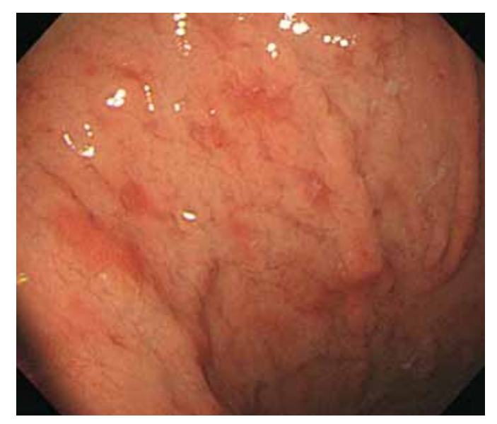
Figure 4. After 3 years of follow-up, an upper endoscopic examination revealed an improved state of the mucosal lesion.