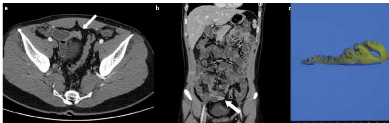
Figure 1. a-c. Patient 1, a 25-year-old man with hematochezia. CT enterography presents an outpouching structure with enhancement at the distal ileum (arrow) (a, b) . Pathologic specimen shows that Meckel's diverticulum measures 4.5 cm in length and 1.0 cm in diameter (c) .