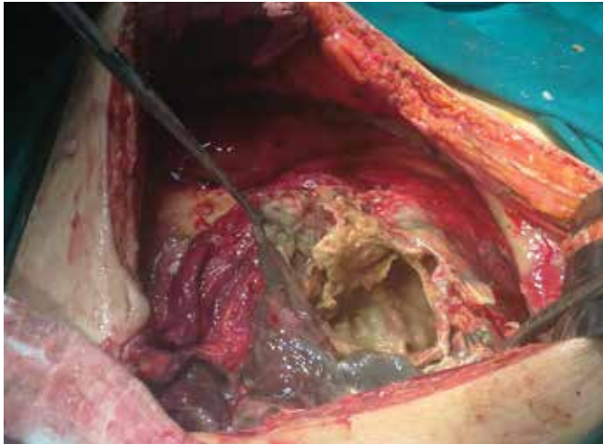
Figure 2. Intraoperative view of the ruptured giant splenic hydatid cyst.