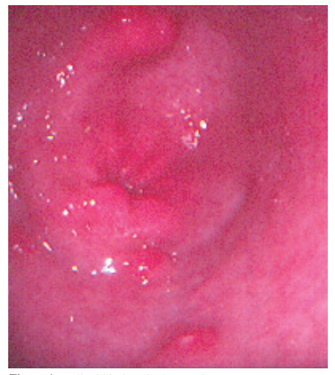
Figure 1. Polipoid lesions in the gastric antrum

Address for correspondence: Hale GÖKCAN Başkent Üniversitesi Fevzi Çakmak Caddesi, 10. Sok. No: 45 Bahçelievler 06490, Ankara, Turkey Phone: + 90 312 212 68 68/1205-1206 • Fax: + 90 312 215 42 16 E-mail: halesumer@yahoo.com