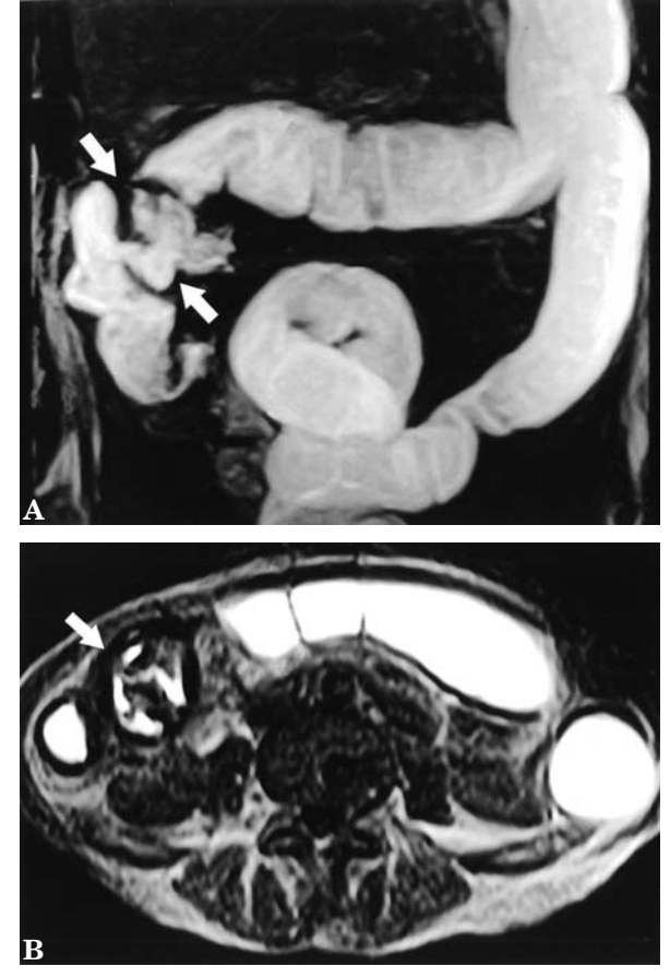
Figure 3. A 59-year-old woman with cecum and ascending colon carcinoma. A) MR colonography MIP image shows asymmetrical, irregular wall thickening at the cecum and ascending colon segments (arrows). B) T1-weighted axial plane image shows asymmetrical wall thickening at the cecum (arrow)

Fifteen patients with primary colon tumors underwent CC. A complete CC was achieved in 12 patients. In three patients, CC could not be evaluated completely due to occlusive carcinoma. However, MRC was performed for complete examination of the colon in these patients. Results of MRC were compared with colonoscopy, histopathologic examination and surgery results. All patients with colon tumors were correctly identified on MRC. Twelve adenocarcinomas, two mucinous adenocarcinomas and one tubulovillous adenoma (carcinoma in sutu) were confirmed by histopathologic examination. In two of them, additional (one more) colonic lesions (polyp) were determined. Polyps detected by CC were not diagnosed with MRC (3 mm in 1 patient and 7 mm in the other). In one of them the MR examination was performed insufficiently because of technical reasons. In the other