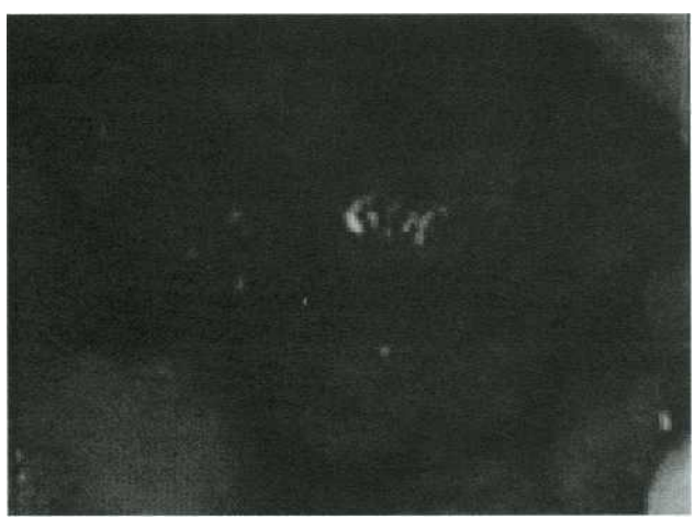
Figure 2. Endoscopic view of the antrum, corpus, and pylori in the stomach. Mucosa with paving stone appearance, diffuse polypoid lesions, mucosal nodulations, and narrowed pylori can be seen

doscope had to be forced to advance it to the stomach. Mucosa and pleats of the stomach had a normal appearance. Diffuse ulcers with rough and granulated surroundings with diameters of 1-3 cm were observed in the antrum and corpus of the stomach. Mucosa there had the appearance of paving stones. There were mucosal nodulations in places, and biopsies were taken. The expansion of the lumen in the antrum was not sufficient, the antrum and pylori were narrowed, and the endoscope had to be forced to advance it to the duodenum (Figure 2). The bulbus and the second part of the duodenum were normal.