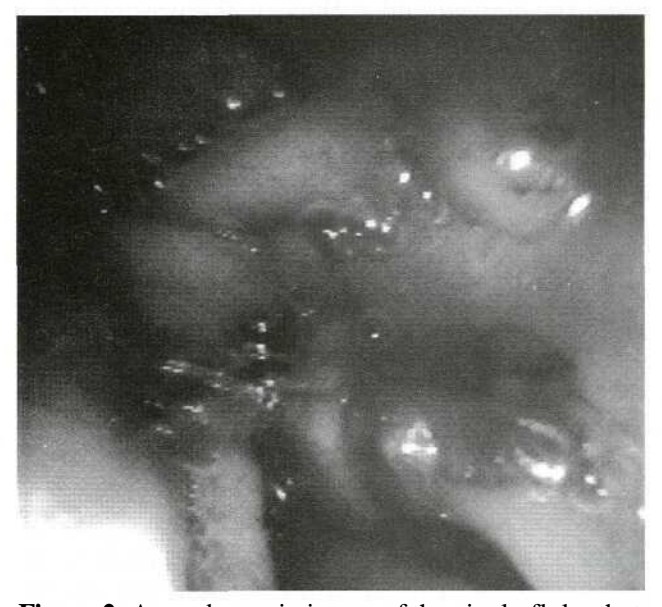
Figure 2. An endoscopic image of the single fluke that was physically removed from the biliary tract.

The patient was asked to attend follow-up and was discharged with a prescription for bithionol, with a total 30mg/kg dose given three times on alternate days. At a follow-up visit two months later, the patient stated she was well and her clinical and laboratory assessments were within normal limits. Repeat US revealed a normal-sized choledochus.